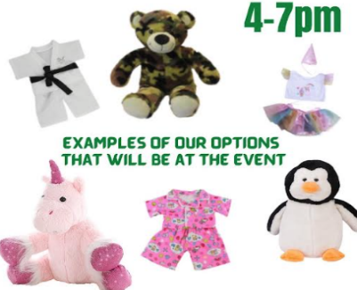
EXAMPLES OF OUR OPTIONS THAT WILL BE AT THE EVENT

Our mission is to bring smiles to every child at a Teddy Bear Mobile Las Vegas Event as they have fun creating their very own stuff animal friend!